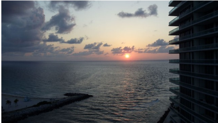
Sunrise over the Atlantic Ocean

On our return, we decide to have breakfast outside on the hotel's waterfront patio. The menu offers a range of choices from healthy to decadent. We order fresh-squeezed Florida grapefruit juice and indulge in the Grand Marrier French Toast. There is also an extensive buffet on offer with everything from fresh fruit, cereals and pastries to meats, cheeses and individually prepared omelets. We take our time this morning relaxing and reading.