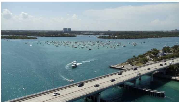
Weekend party on the sand bar