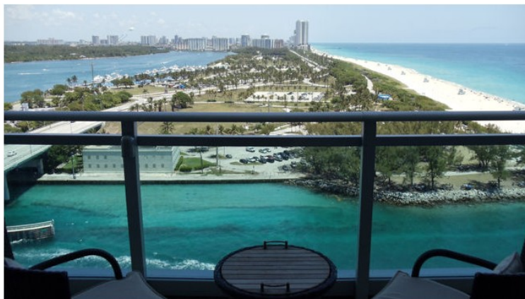
North-facing view from living room balcony, Suite #1414

We settle in to our 14th floor suite and I find myself going from one balcony to the other to take in the amazing panoramas. From the living room we look out on an expanse of green that stretches to the towers of the Trump International Beach Resort in Sunny Isles. From the bedroom balcony I can see the beautiful mansions of Bal Harbour with marina and golf course and then beyond to the downtown Miami skyline.