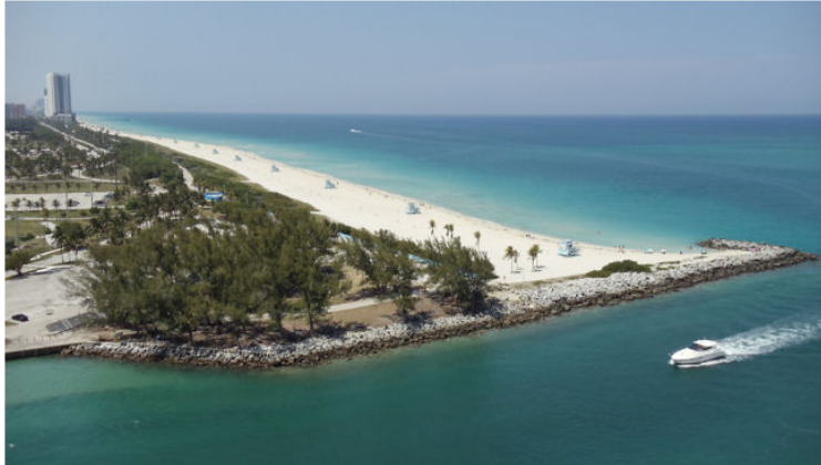
ONE Bal Harbour Resort & Spa beach view from Suite #1414

Turning the other direction, I am once again mesmerized by the idyllic fine sand and turquoise water of Miami Beach.