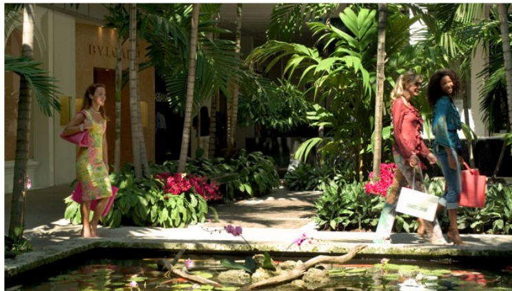
Bal Harbour Shops

The hotel is ideally situated close to Miami's most upscale shopping and dining experience -- the Bal Harbour Shops . Mid-morning we head to the lobby to take the hotel's complimentary car to the shops, just a couple of minutes away. The five blocks can be easily walked for those so inclined.