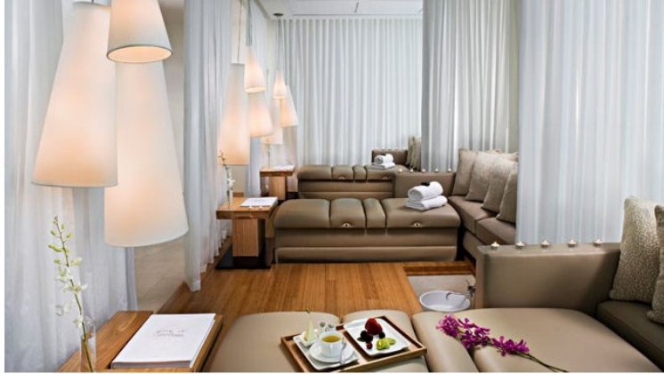
Spa relaxation/mani-pedi room

We return to the hotel for an afternoon of spa treatments. I choose the 50-minute Signature Massage, followed by a 25-minute Pure Oxygen Facial. I'm very pleased and wish I had opted for the longer versions (80 minutes and 50 minutes, respectively). In addition to a massage, my husband agrees to try the Gentleman's Rejuvenation Facial and gives it the two thumbs up!