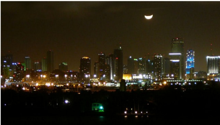
Moon over Miami

This weekend has been all about the views, so what could be more amazing than returning to our suite tonight and seeing the moon over Miami? We can't wait to return and add a seaplane or helicopter tour to our itinerary, so we can discover even more of Miami from the air.